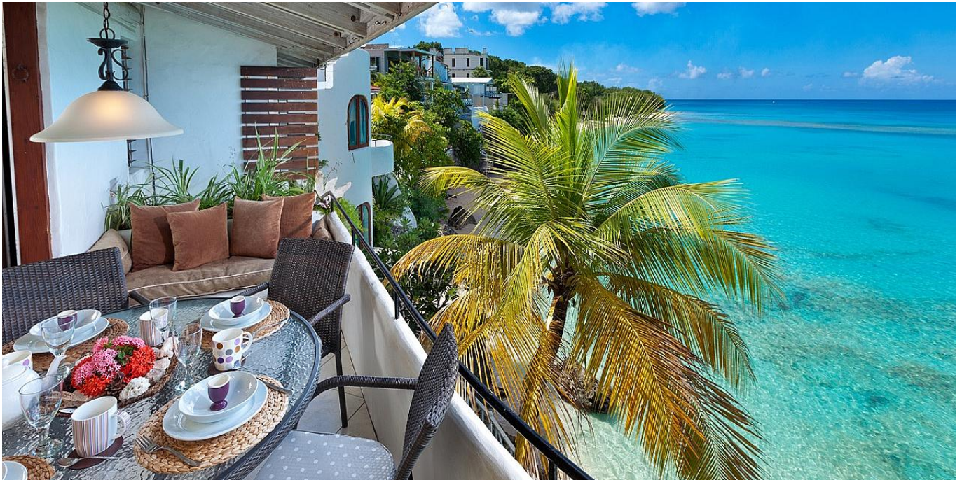
BEACHFRONT - CORALITA APARTMENTS , 5 BEDROOMS , 5.5 BATHROOMS PRICE : $1,800,000 USD